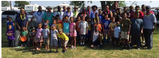
Fun with Dad.