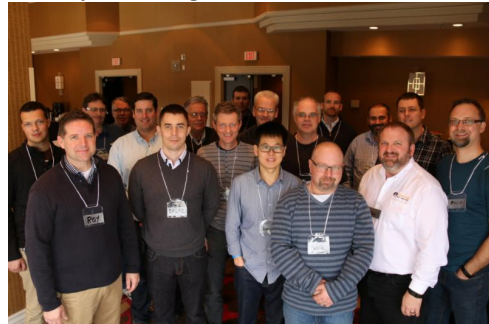
A Band of Mighty Men!

with thanks, nicely ask for things and then walked out...without listening for his requests of you? Not long. So why do we pray like that