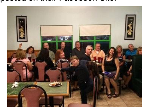
Enjoying some time together.

Blessings on their work, please pray for these groups. The BC SDA Singles Group has now almost 230 members from 4 states and their events are all posted on their Facebook Site.