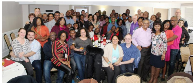
Joyful hearts looking towards a better future.