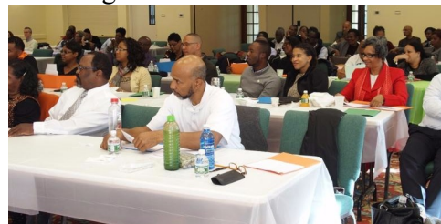
Charting the course of the heart.

to ask all sorts of questions. They actually went over their allotted time which the women wanted to know what in the world did they want to know so bad. Each couple was also allowed time to have couple and one on one counseling. God blessed abundantly and beyond what we could have ever imagined. One of the most memorable was when