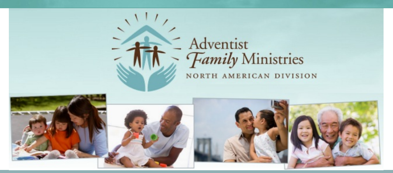
NAD Family Ministries Website