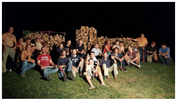
Pictured here are the sweaty lumberjack teams with their wall of hand split oak at the annual Chainsaws and Butter Knives Men's Rally.

past year Blueprint for Men provided the following momentum events: The Fire and Ice Symposium, the Men's Ministry Leadership Summit, the Chainsaws and Butter Knives Men's Rally, and the Broken Beauty Men's Retreat.