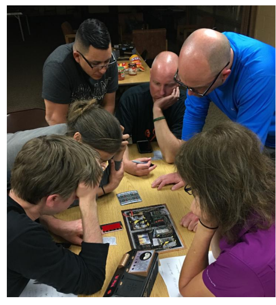
Singles' Ministry events include team-building exercises like the Escape Room Challenge.

the church needs to adapt and react in ways that fit the needs of its members, and singles are a subsection that are often overlooked. The reason for this is a misconception of what singles' ministry really is, the stigmas surrounding it,