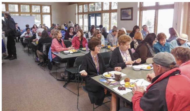
This is what 121 people having Sabbath lunch looks like.