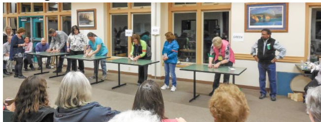
The College Place Singles group provided some great games Saturday night!

Keep us in your prayers as we continue to plan events and activities that will minister to the singles in our churches. Thank you for your support in making this retreat the success that it was!